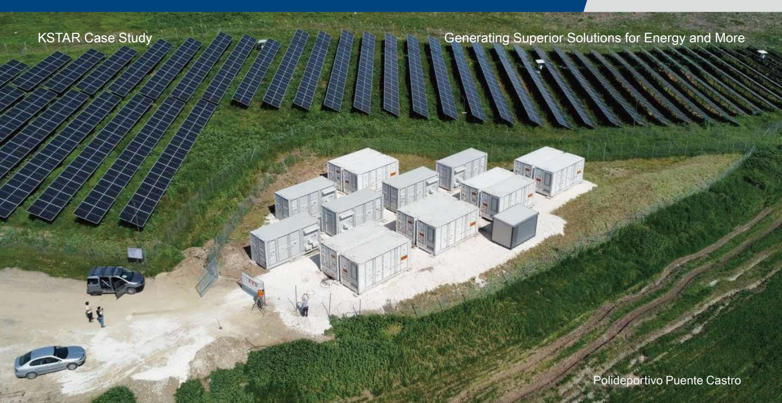
Polideportivo Puente Castro